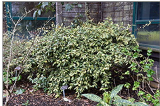
Chirifu Variegated Silverberry