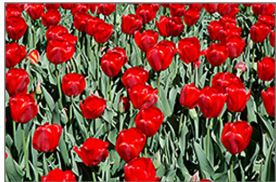
Parade Tulip flowers