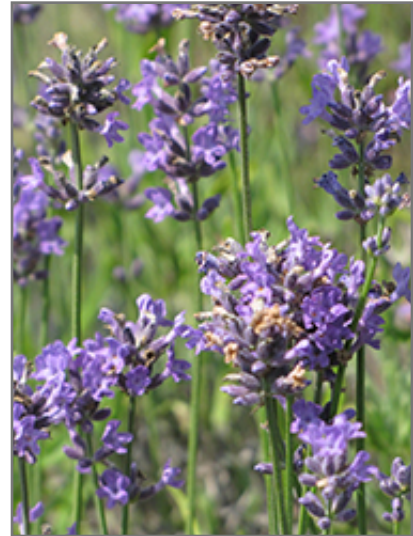
Buena Vista Lavender flowers

Buena Vista Lavender is a dense multi-stemmed evergreen shrub with a mounded form. It lends an extremely fine and delicate texture to the landscape composition which should be used to full effect.