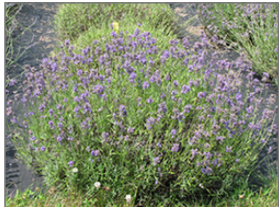
Buena Vista Lavender in bloom