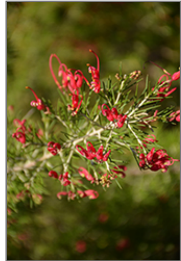
Wilson's Grevillea flowers

This is a relatively low maintenance shrub, and should only be pruned after flowering to avoid removing any of the current season's flowers. It is a good choice for attracting birds and butterflies to your yard, but is not particularly attractive to deer who tend to leave it alone in favor of tastier treats. Gardeners should be aware of the following characteristic(s) that may warrant special consideration;