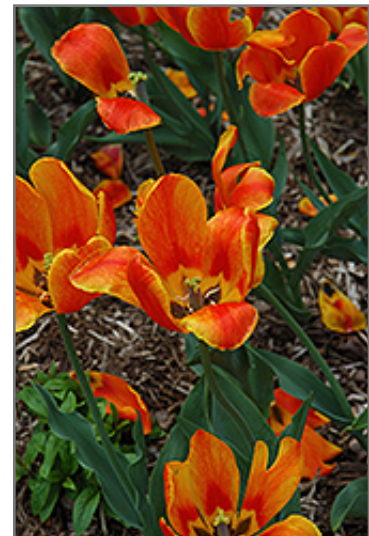
Flair Tulip flowers