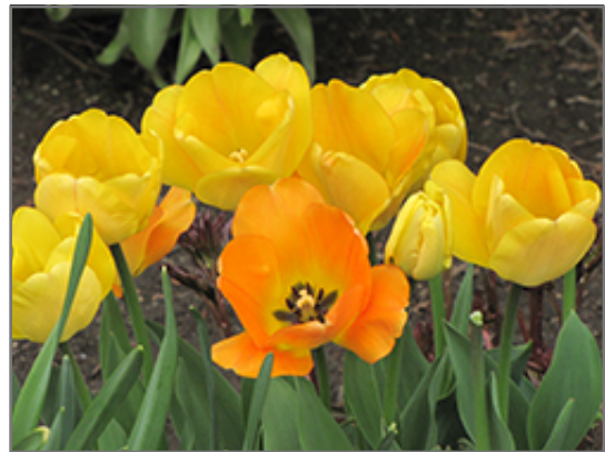
Daydream Tulip in bloom