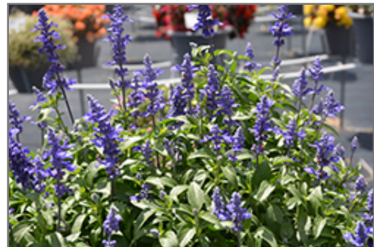
Icon Dark Blue Salvia in bloom