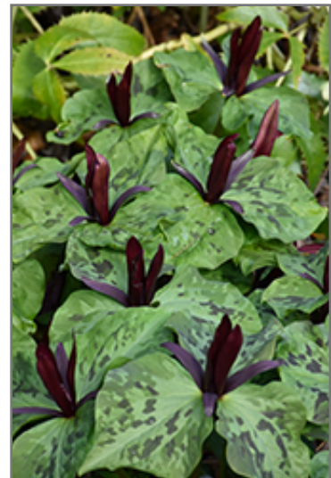
Giant Wake Robin flowers