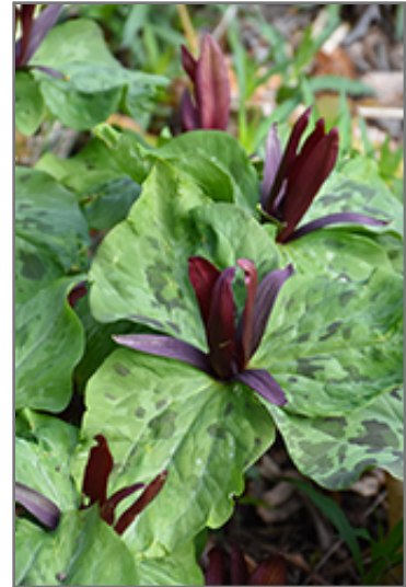
Giant Wake Robin flowers