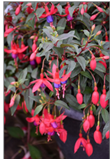
Army Nurse Fuchsia flowers