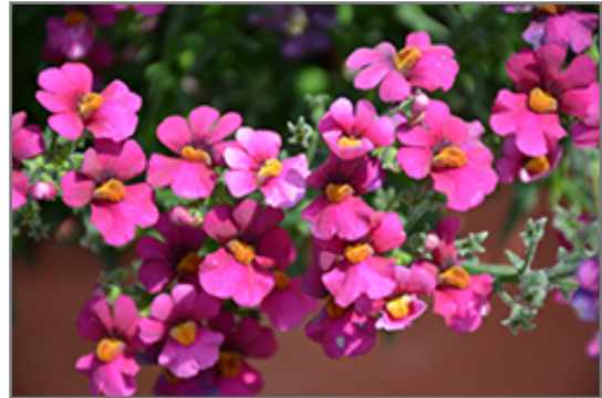
Nessie Plus Purple Nemesis flowers

Nessie Plus Purple Nemesis is recommended for the following landscape applications;