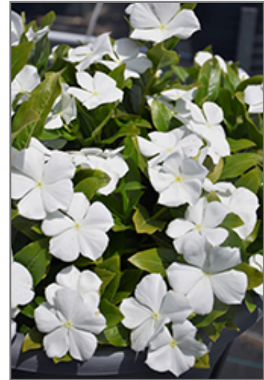
Cora Cascade White Vinca flowers

Cora Cascade White Vinca is recommended for the following landscape applications;