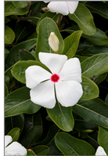
Cora Cascade Polka Dot Vinca flowers

Cora Cascade Polka Dot Vinca is recommended for the following landscape applications;