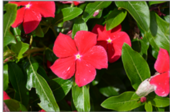
Cora XDR Red Vinca flowers

Cora XDR Red Vinca is recommended for the following landscape applications;