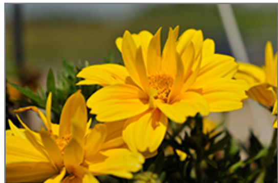
Sun Drop Double Yellow Bidens flowers