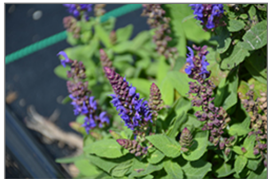
Swifty Violet Blue Meadow Sage flowers