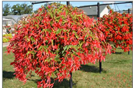
Bossa Nova Rose Begonia flowers