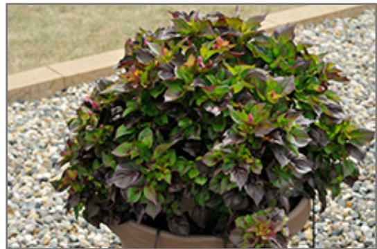
Sol Gekko Green Celosia