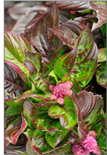
Sol Gekko Green Celosia flowers

Sol Gekko Green Celosia is recommended for the following landscape applications;