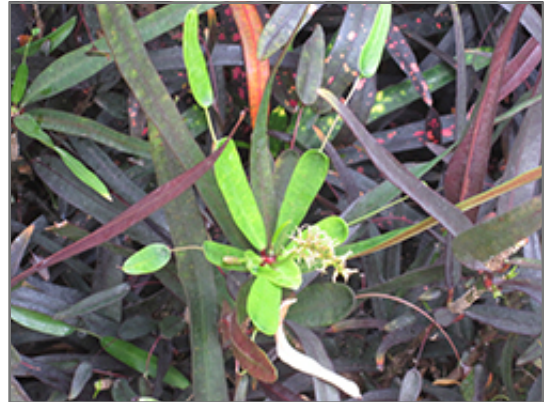
Mother And Daughter Croton flowers

This is a dense herbaceous evergreen houseplant with an upright spreading habit of growth. Its wonderfully bold, coarse texture is quite ornamental and should be used to full effect. This plant should not require much pruning, except when necessary to keep it looking its best.