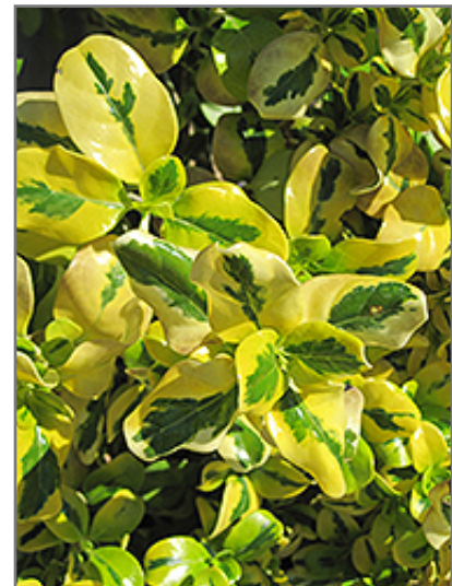
Taupata Gold Mirror Bush foliage