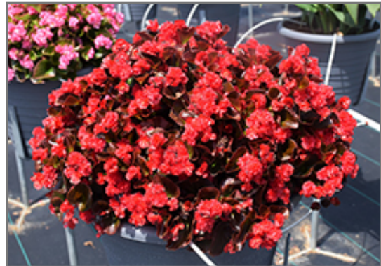
Double Up Red Begonia in bloom