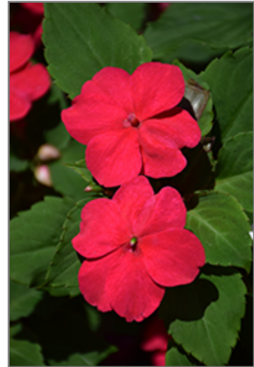
Imara XDR Rose Impatiens flowers

Imara XDR Rose Impatiens is recommended for the following landscape applications;