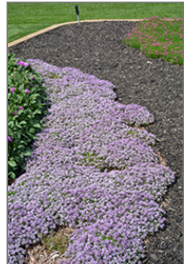
Yolo Lavender Sweet Alyssum in bloom