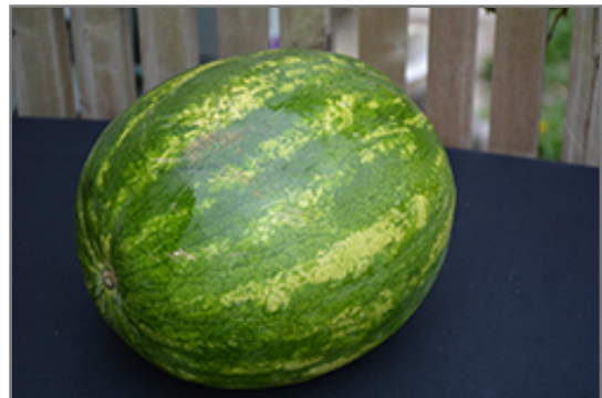
Solitaire Watermelon fruit