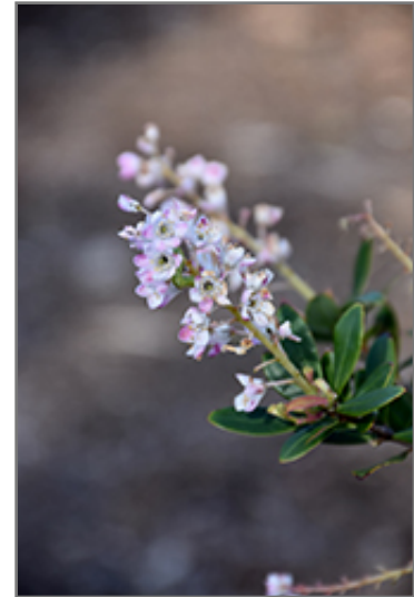
Chipolo Pink Titi Tree flowers