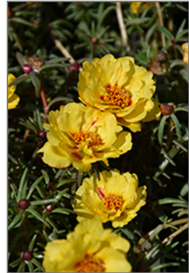
Happy Hour Banana Portulaca flowers

Happy Hour Banana Portulaca is recommended for the following landscape applications;