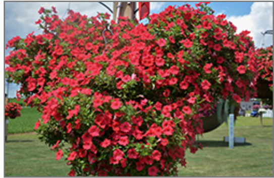
ColorRush Watermelon Red Petunia in bloom

ColorRush Watermelon Red Petunia is a fine choice for the garden, but it is also a good selection for planting in outdoor containers and hanging baskets. It is often used as a 'filler' in the 'spiller-thriller-filler' container combination, providing a mass of flowers against which the thriller plants stand out. Note that when growing plants in outdoor containers and baskets, they may require more frequent waterings than they would in the yard or garden.