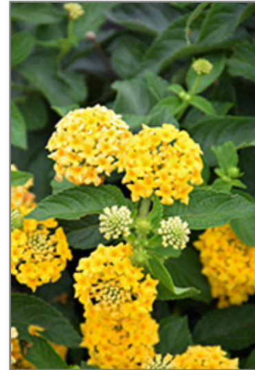
Landscape Bandana Yellow Lantana flowers

Landscape Bandana Yellow Lantana is recommended for the following landscape applications;