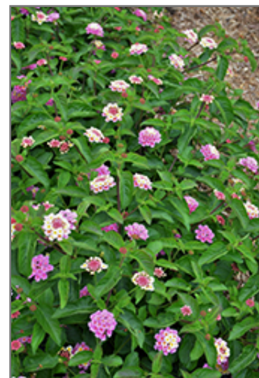
Landscape Bandana Pink Lantana in bloom