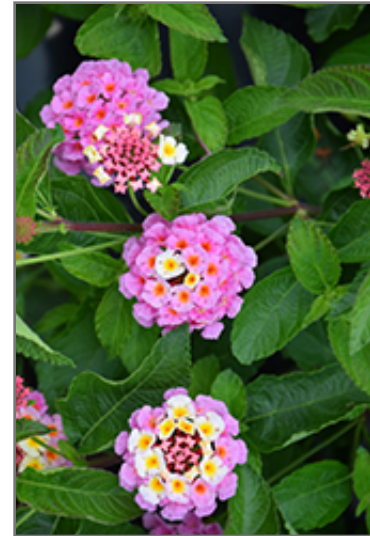
Landscape Bandana Pink Lantana flowers

Landscape Bandana Pink Lantana is recommended for the following landscape applications;