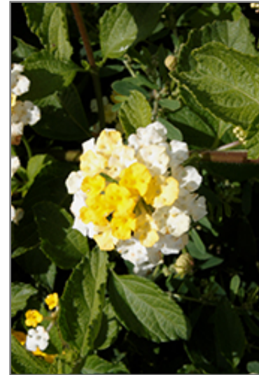
Landscape Bandana Lemon Zest Lantana flowers

Landscape Bandana Lemon Zest Lantana is recommended for the following landscape applications;