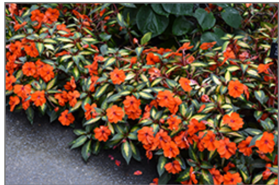
SunPatiens Vigorous Tropical Orange New Guinea Impatiens in bloom