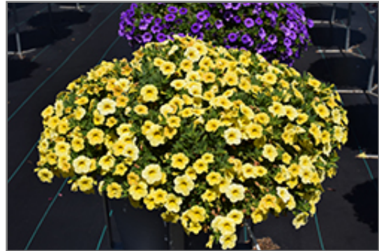
Colibri Lemon Calibrachoa in bloom

Colibri Lemon Calibrachoa is a fine choice for the garden, but it is also a good selection for planting in outdoor containers and hanging baskets. It is often used as a 'filler' in the 'spiller-thriller-filler' container combination, providing a mass of flowers against which the thriller plants stand out. Note that when growing plants in outdoor containers and baskets, they may require more frequent waterings than they would in the yard or garden.