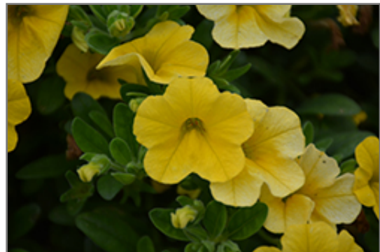
Colibri Lemon Calibrachoa flowers