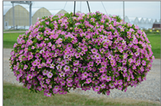
Chameleon Starlet Pink Calibrachoa in bloom