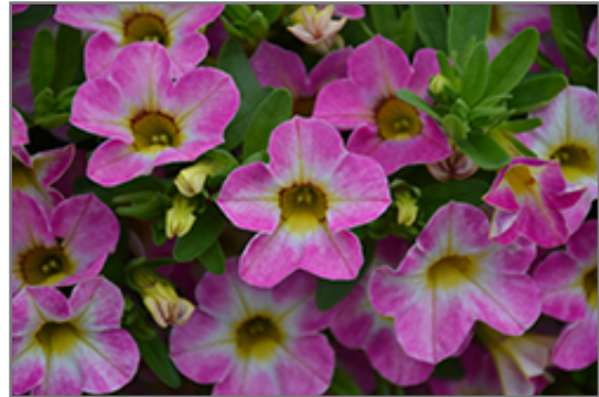
Chameleon Starlet Pink Calibrachoa flowers

Chameleon Starlet Pink Calibrachoa is a dense herbaceous annual with a trailing habit of growth, eventually spilling over the edges of hanging baskets and containers. Its medium texture blends into the garden, but can always be balanced by a couple of finer or coarser plants for an effective composition.