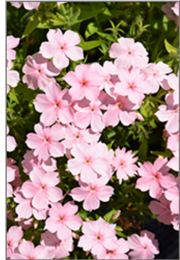
Gisele Light Pink Phlox flowers

Gisele Light Pink Phlox is recommended for the following landscape applications;