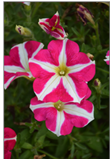
Amore Pink Heart Petunia flowers