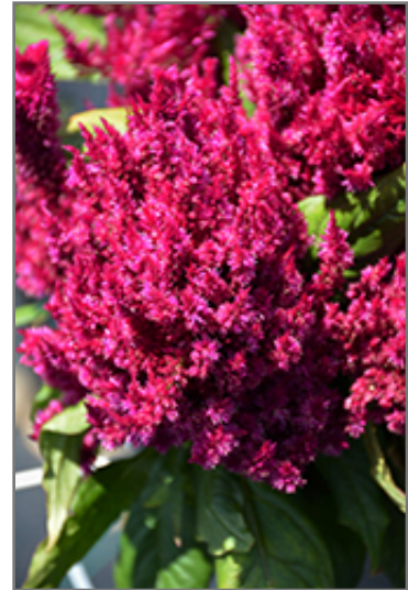
First Flame Purple Celosia flowers

First Flame Purple Celosia is recommended for the following landscape applications;