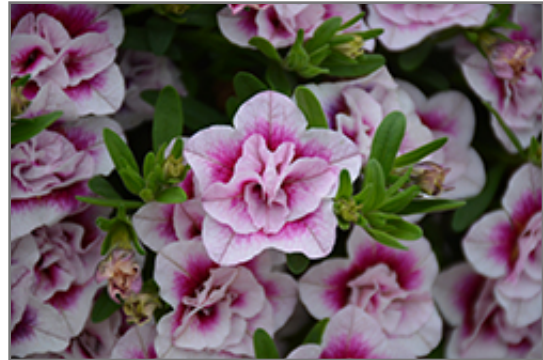
MiniFamous Uno Double PinkTastic Calibrachoa flowers

MiniFamous Uno Double PinkTastic Calibrachoa is a dense herbaceous annual with a trailing habit of growth, eventually spilling over the edges of hanging baskets and containers. Its medium texture blends into the garden, but can always be balanced by a couple of finer or coarser plants for an effective composition.