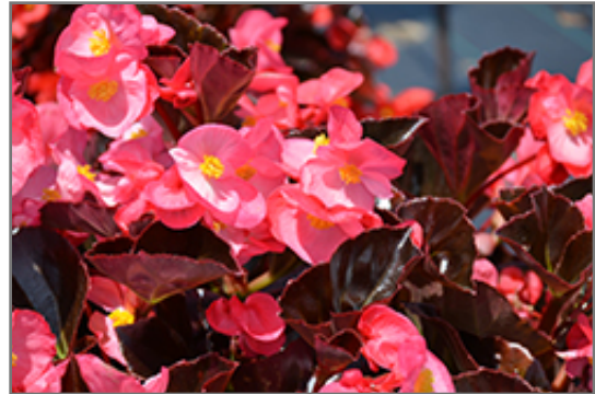
Viking Pink on Chocolate Begonia flowers

Viking Pink on Chocolate Begonia is recommended for the following landscape applications;