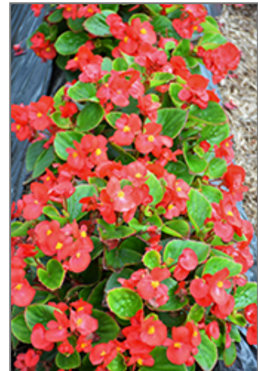
Topspin Scarlet Begonia in bloom