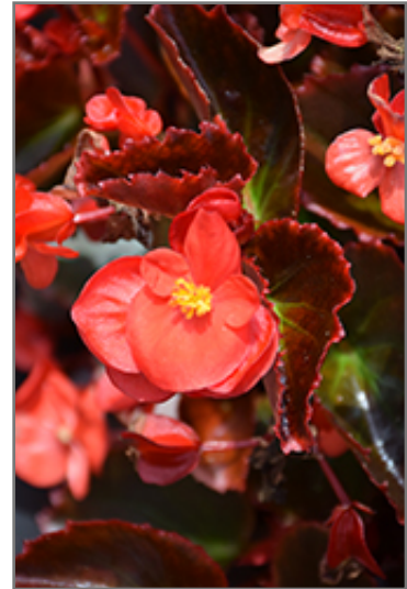
Senator IQ Scarlet flowers