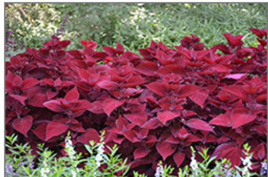
Beale Street Coleus