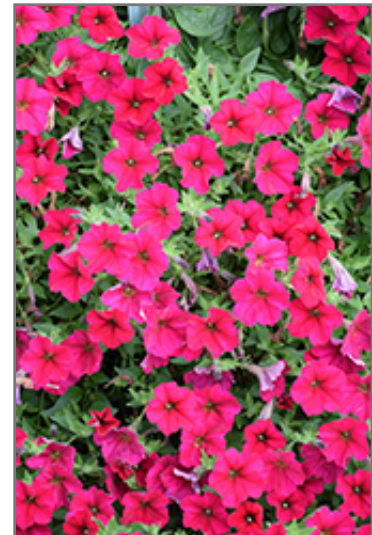
Wave Carmine Velour Petunia flowers