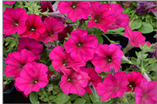
Wave Carmine Velour Petunia flowers

This plant will require occasional maintenance and upkeep. Trim off the flower heads after they fade and die to encourage more blooms late into the season. It is a good choice for attracting hummingbirds to your yard, but is not particularly attractive to deer who tend to leave it alone in favor of tastier treats. It has no significant negative characteristics.