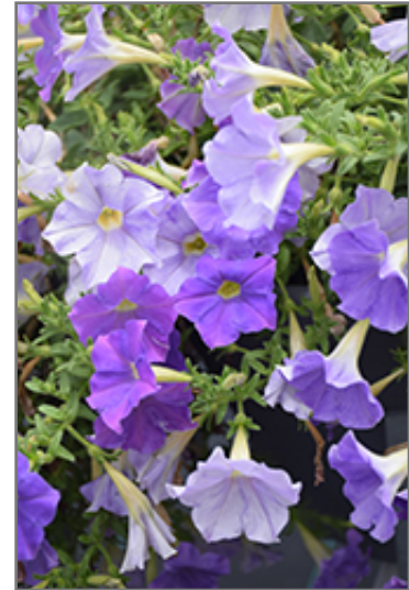
Supertunia Blue Skies Petunia flowers

Supertunia Blue Skies Petunia is recommended for the following landscape applications;