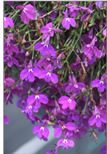
Laguna Ultraviolet Lobelia flowers