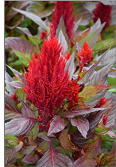
New Look Celosia flowers

New Look Celosia is recommended for the following landscape applications;