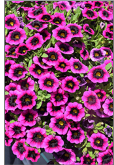
Superbells Blackcurrent Punch Calibrachoa flowers

Superbells Blackcurrent Punch Calibrachoa is recommended for the following landscape applications;