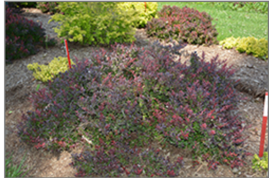
Sunjoy Todo Japanese Barberry

This shrub does best in full sun to partial shade. It is very adaptable to both dry and moist growing conditions, but will not tolerate any standing water. It is not particular as to soil type or pH, and is able to handle environmental salt. It is highly tolerant of urban pollution and will even thrive in inner city environments. This particular variety is an interspecific hybrid.