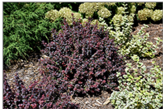
Sunjoy Todo Japanese Barberry