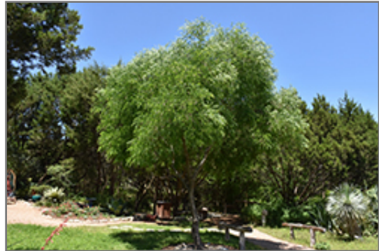
Eve's Necklace