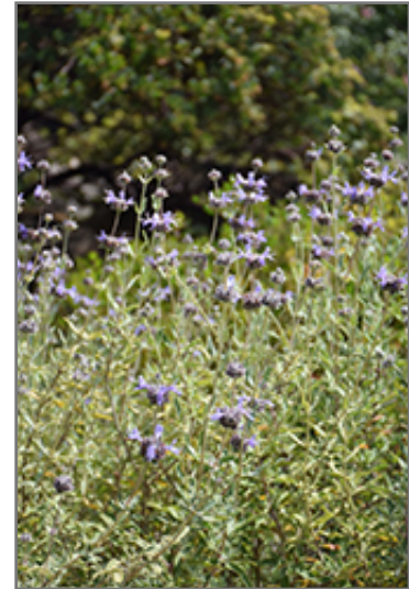
Allen Chickering Sage flowers

This shrub should only be grown in full sunlight. It prefers dry to average moisture levels with very well-drained soil, and will often die in standing water. It is considered to be drought-tolerant, and thus makes an ideal choice for xeriscaping or the moisture-conserving landscape. It is not particular as to soil type or pH. It is somewhat tolerant of urban pollution. This particular variety is an interspecific hybrid. It can be propagated by cuttings; however, as a cultivated variety, be aware that it may be subject to certain restrictions or prohibitions on propagation.