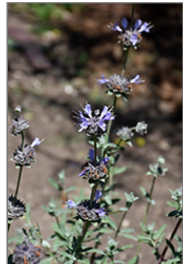
Allen Chickering Sage flowers