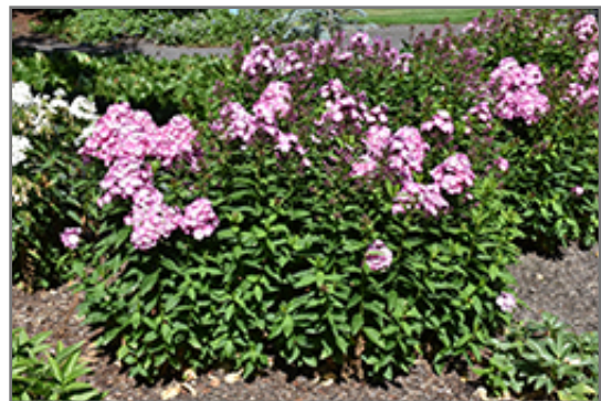
Volcano Pink with White Eye Garden Phlox in bloom