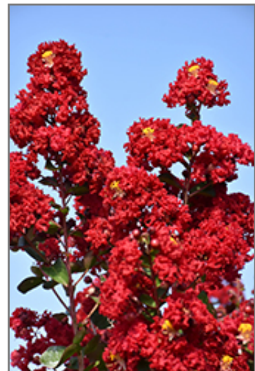
Double Dynamite Crapemyrtle flowers